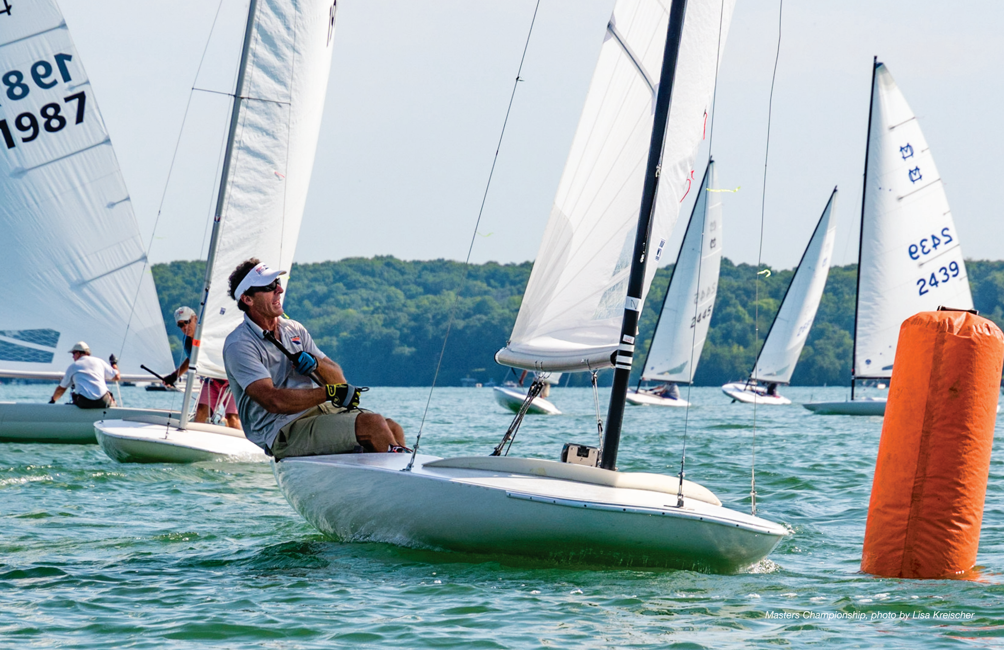
Masters Championship