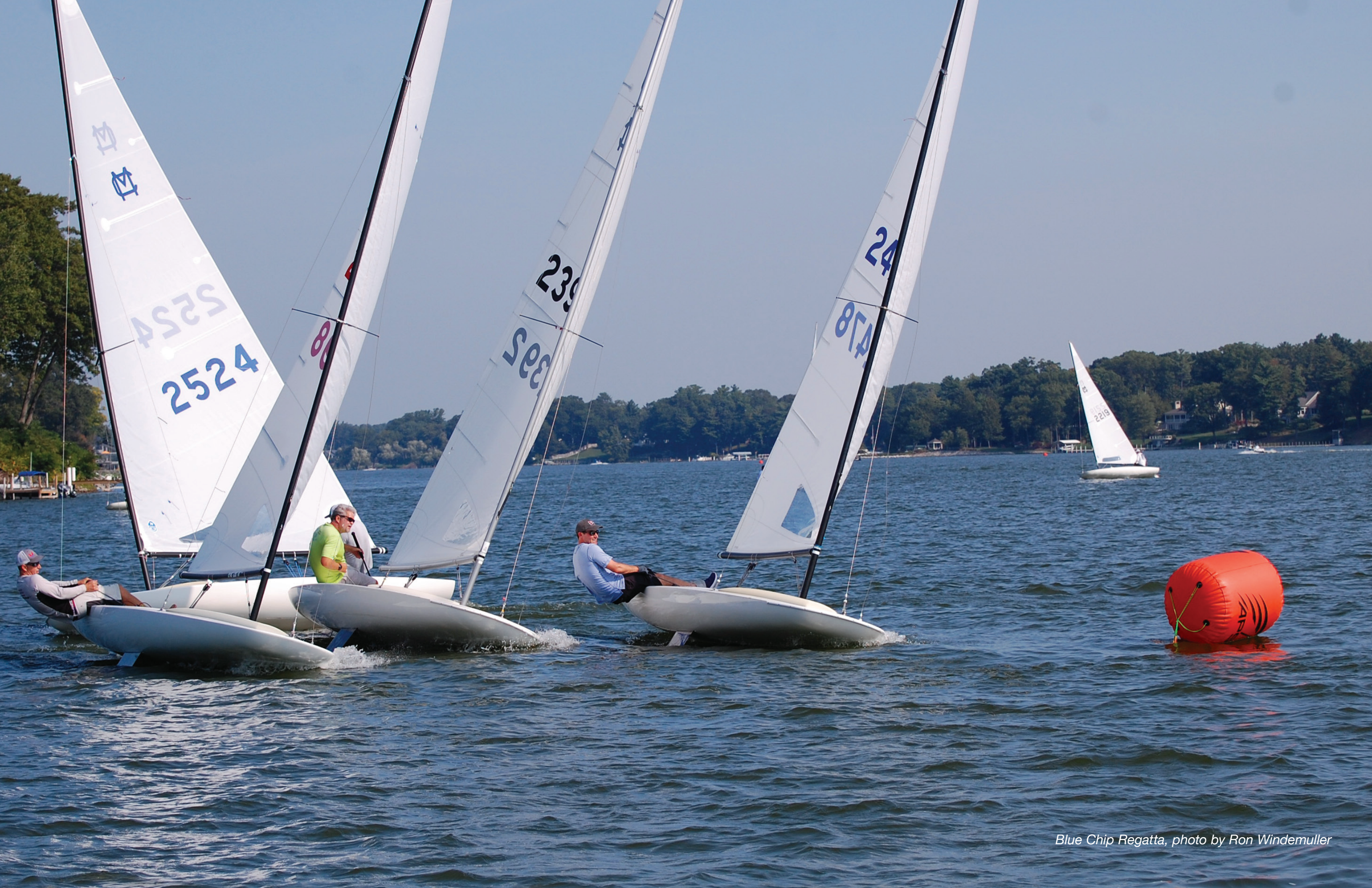
Blue Chip Regatta, photo by Ron Windemuller