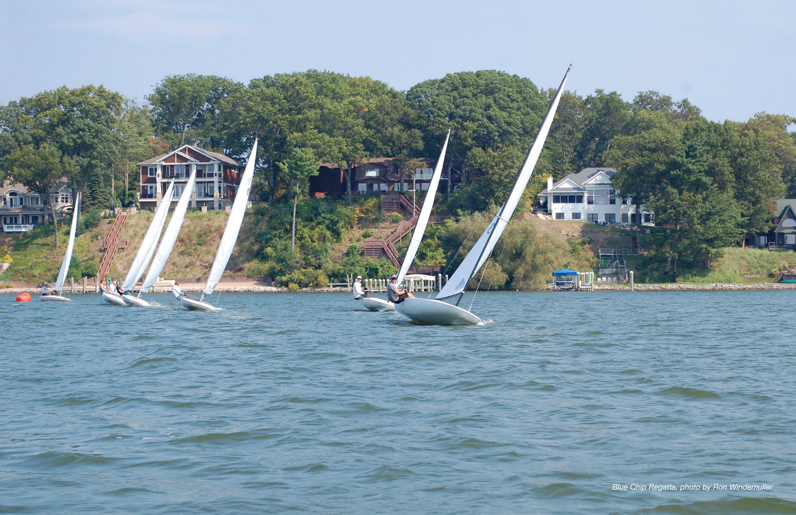
Blue Chip Regatta