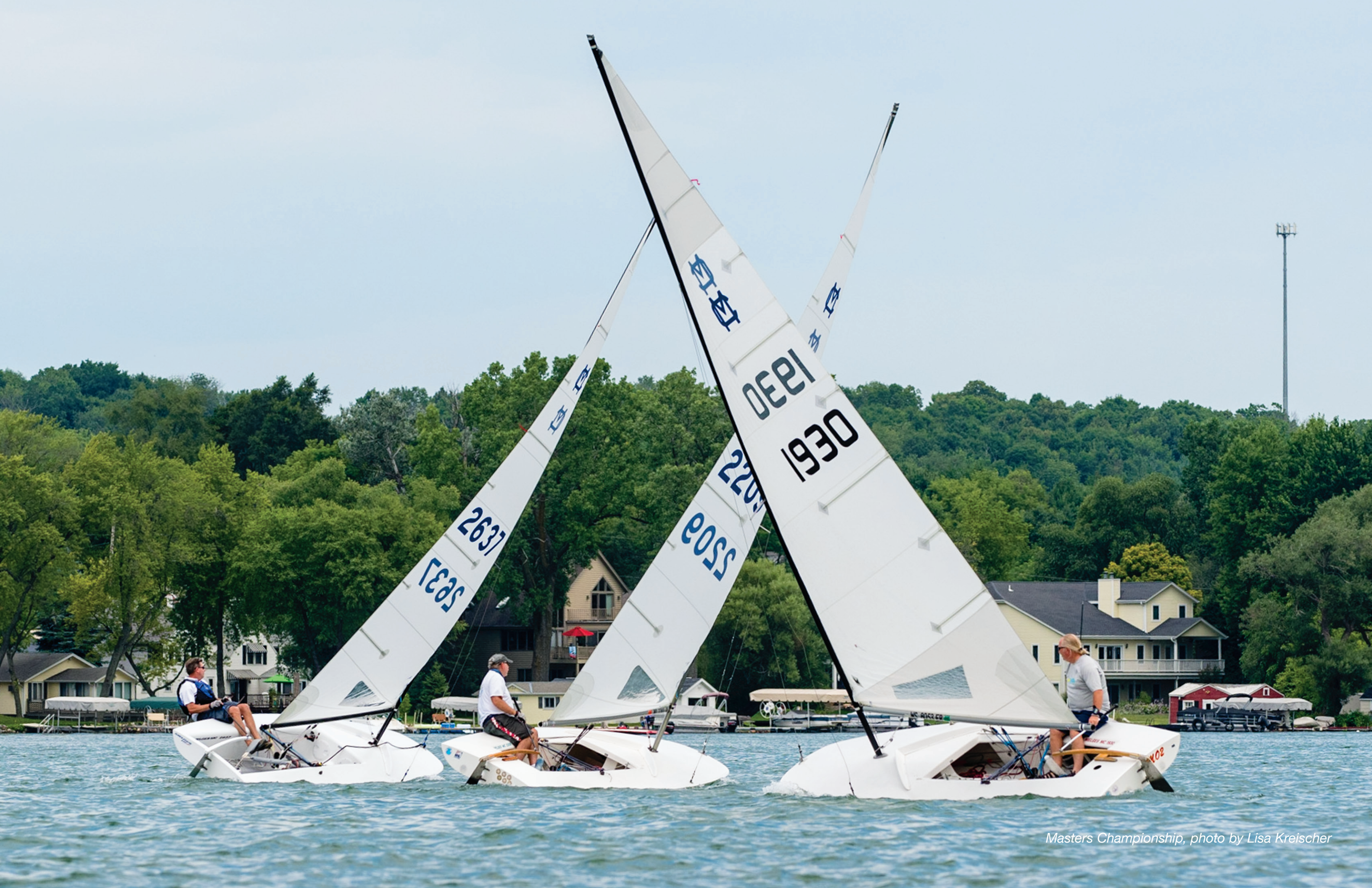
Masters Championship