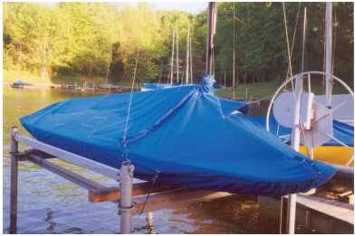
Skirted Mooring Cover is pictured. Also available: Traveling cover, Bottom cover, Cockpit cover.