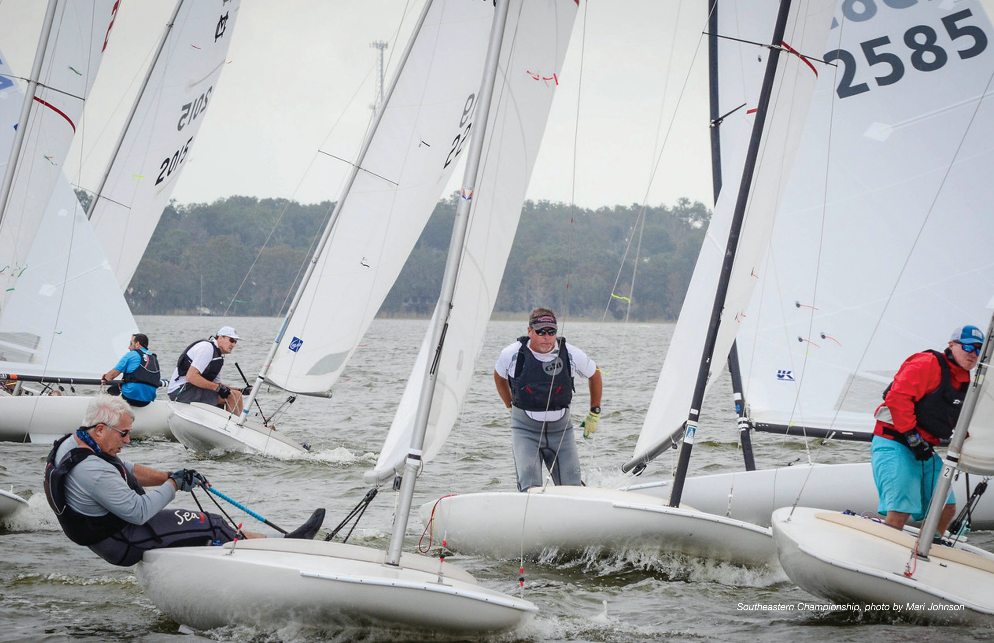
Southeastern Championship