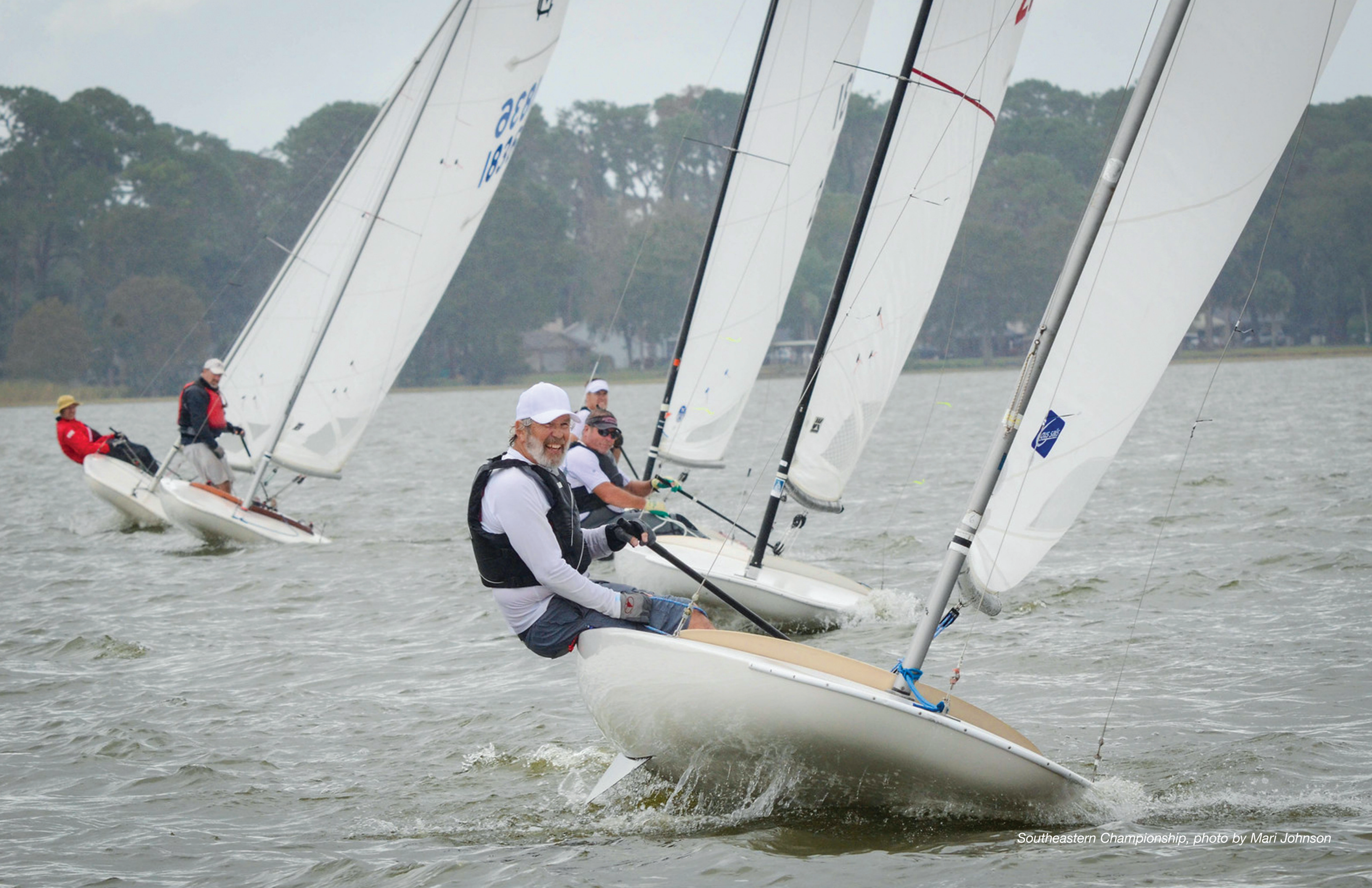
Southeastern Championship