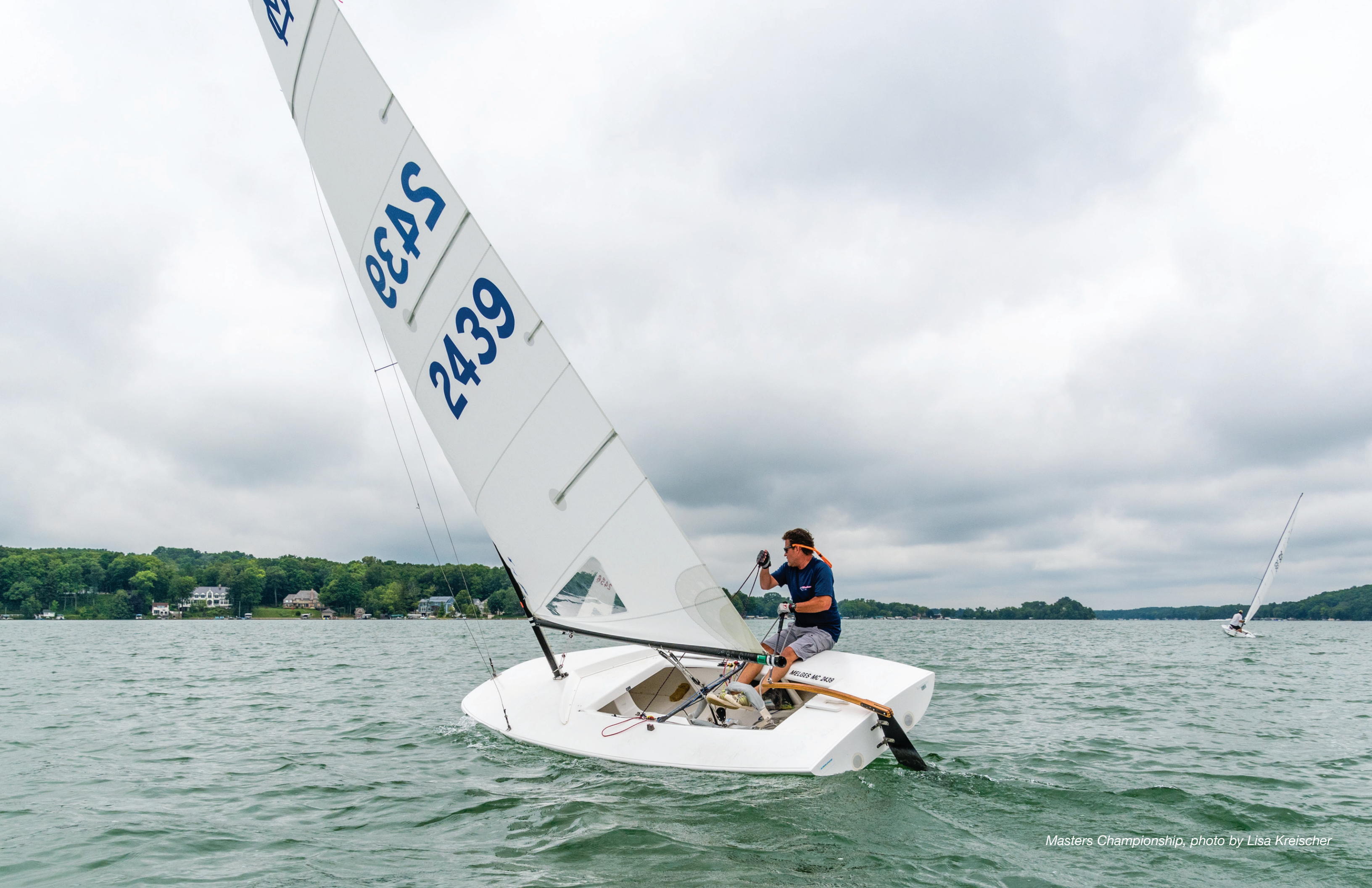
Masters Championship