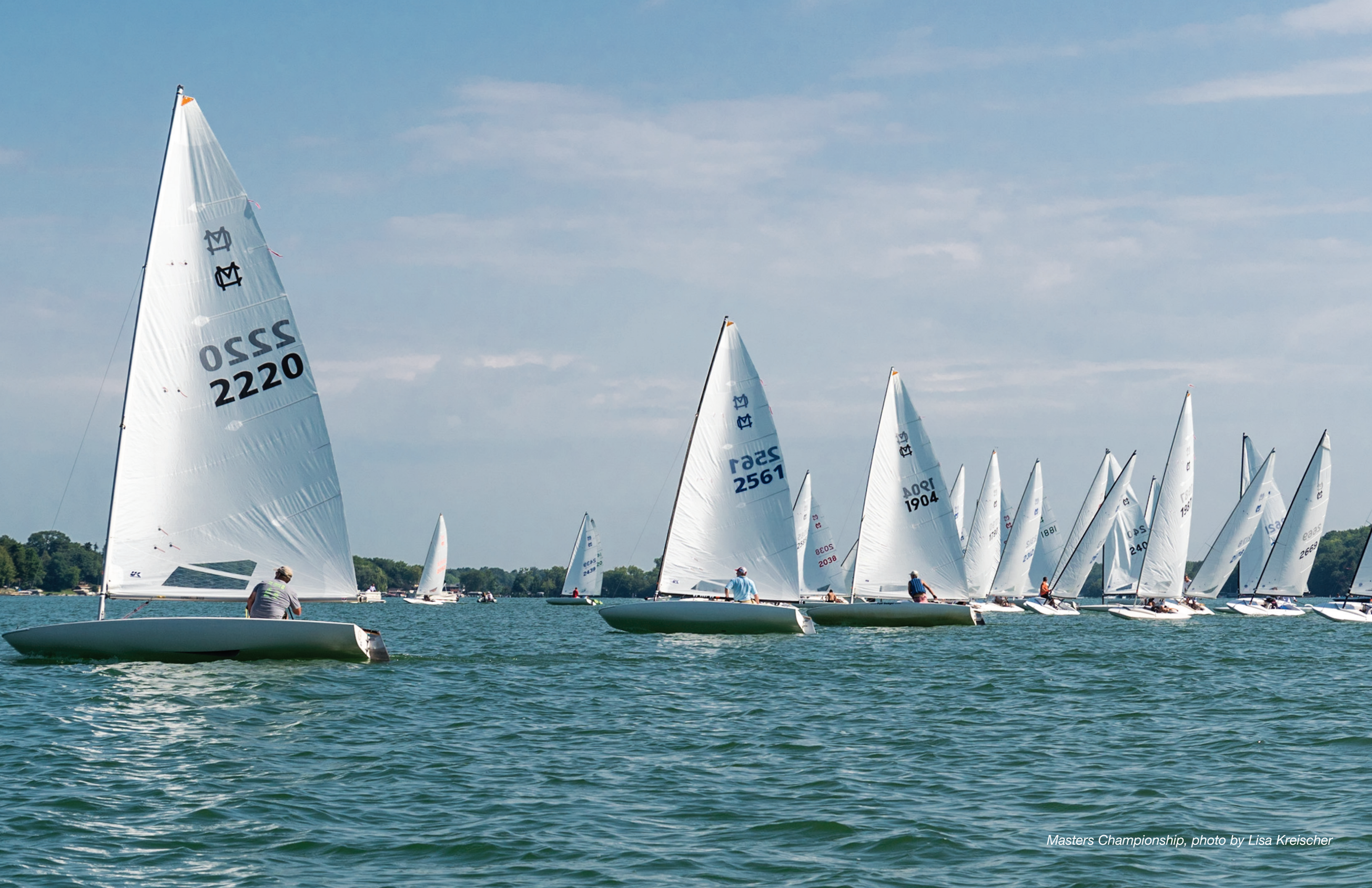
Masters Championship